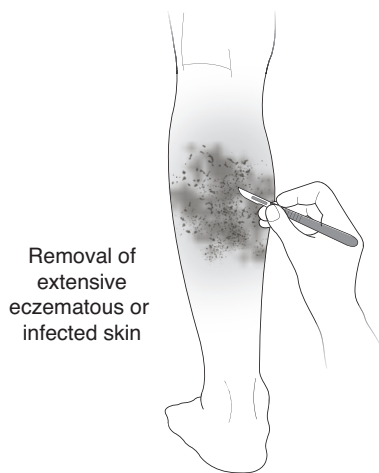
Removal of extensive eczematous or infected skin